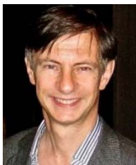
Mayor Pro Tem Rupert Russell

The Town has received a federal Highway Safety Improvement Program grant for $443,000 for the project. The Town has committed to contributing an additional $110,000 to the project. Construction is expected to take place this summer.