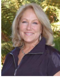
Mayor Carla Small