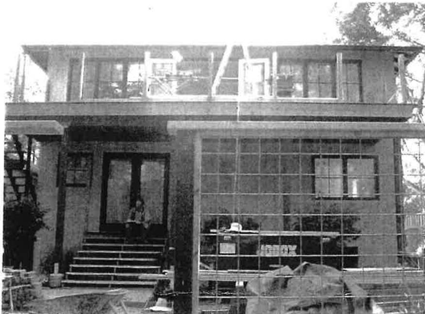
REAR VIEW 9/20/12