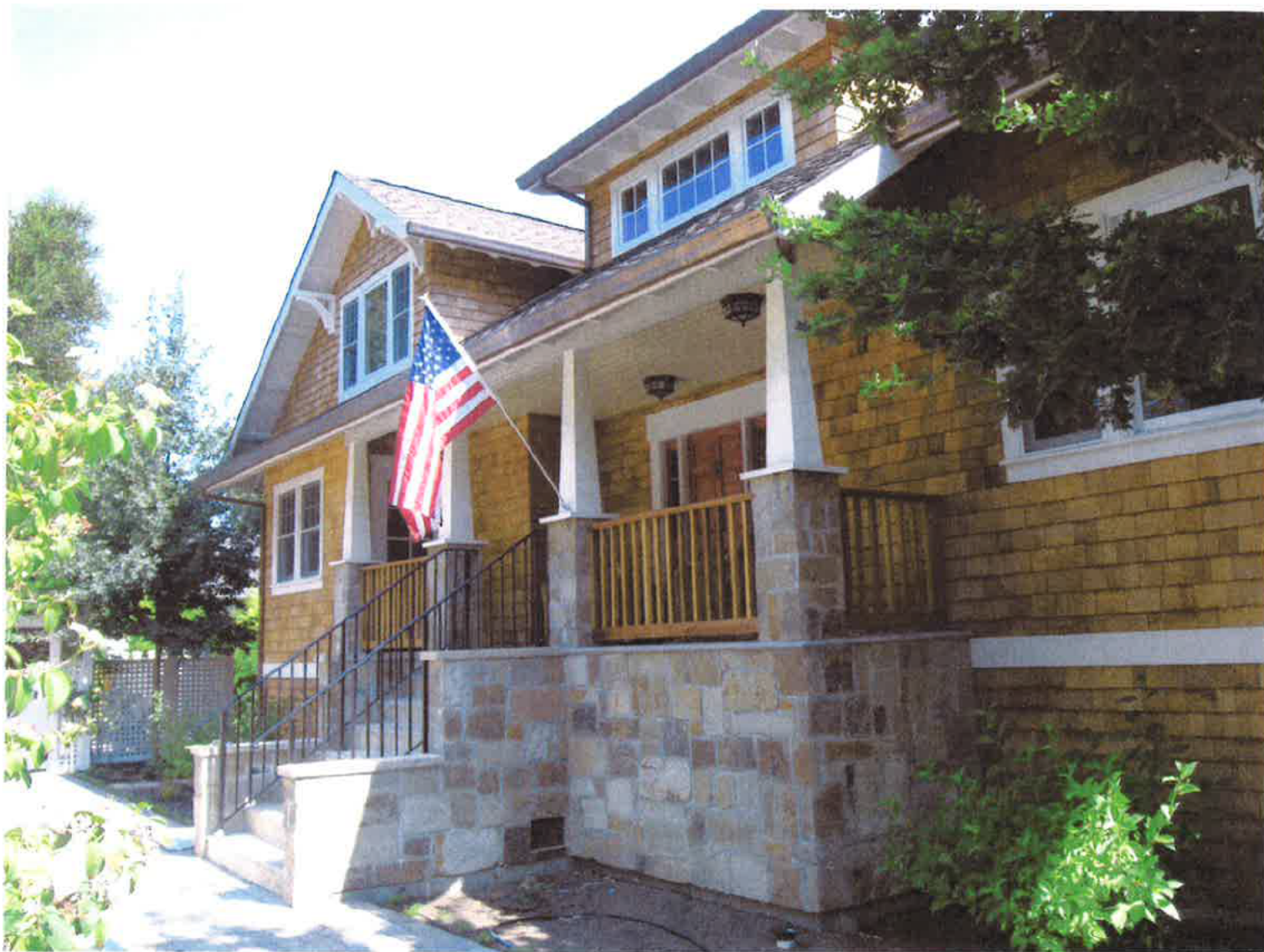
Figure 1: FRONT VIEW Date: 8-12-08

If using the Elevation Certificate to obtain NFIP flood insurance, affix at least two building photographs below according to the instructions for Item A6. Identify all photographs with: date taken; "Front View" and "Rear View"; and, if required, "Right Side View" and "Left Side View." If submitting more photographs than will fit on this page, use the Continuation Page, following.