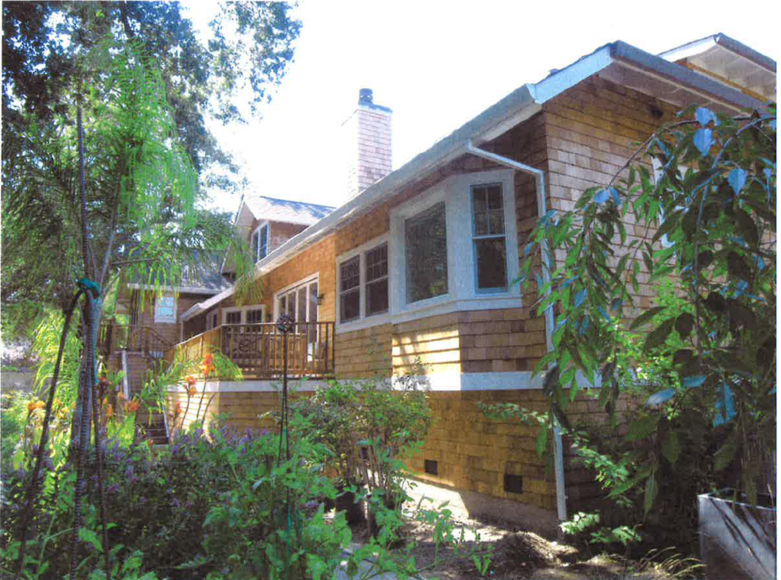
Figure 2: REAR VIEW Date: 8-12-08