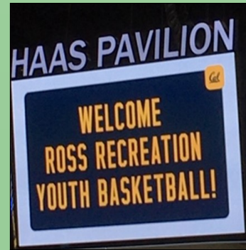
Haas Pavilion welcomes Ross Recreation

The University of California held it's annual youth basketball day on Saturday, February 1st at the Cal men's basketball game versus Oregon State. Representatives from the Ross Recreation youth basketball program attended the game and were treated to a last minute win by the host Bears. Cal recognized those in attendance on the main scoreboard and youth players were allowed to shoot free throws on the court after the game.