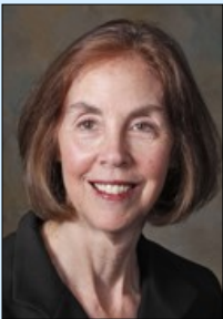
Elizabeth Robbins Mayor

In March, Branson filed an application to amend its use permit seeking to increase the school's enrollment from 320 to 420 students. Residents have been asking about the steps Town staff and the Town Council will take to evaluate this application.