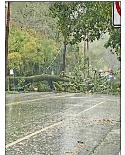
Fallen tree Lagunitas Rd October 25, 2021

We thank our Town employees you for keeping us safe! ■