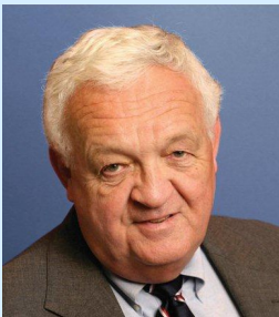
Mayor P. Beach Kuhl

The Ross Town Council frequently deals with routine matters by considering them on our consent calendar, where they can be passed without discussion. They are placed on this calendar when it appears they are not at all